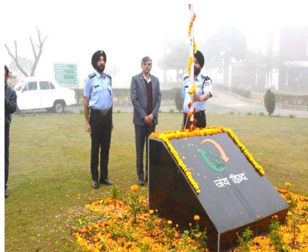
DG, NIBE unfurling the National Flag

The institute actively celebrated the 74 th Republic Day on 26 th January, 2023. The Institute's Director General unfurled the flag on this occasion. Following the unfurling of the flag, DG NIBE planted trees in the institute campus. Researchers, NIBE personnel, and their families also organized a cultural event.