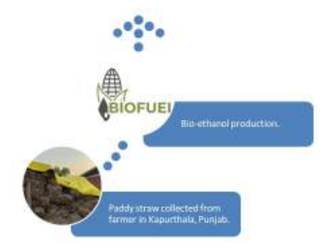
Paddy straw to bioethanol process.

combustion in Japan, and 28% is employed for biogas production in India.<sup>2</sup> Additionally, paddy straw by-products can also serve as fertilizers for agricultural purposes. Furthermore, while there are crops such as corn and sugarcane that are used to derive ethanol, their production is insufficient to meet global demand.