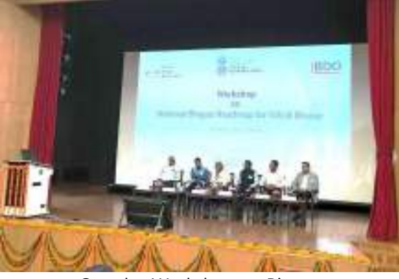
One day Workshop on Biogas

hydrogen. Representatives from various ministries and research institutes attended, contributing innovative for strategies advancing green hydrogen production from biomass. During the meeting, the Director General, SSS-NIBE presented findings on the suitability of available biomass for green production, hydrogen emphasizing the cultivation of rapidly growing biomass with low to medium ash content. The Chair concluded the session by advocating for biomass cultivation on both private and government-owned lands to meet India's energy demands.