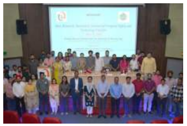
One Day Workshop on Research, Innovation, and Intellectual Property Rights

protect their intellectual property rights (IPR) and technology transfer. Moreover, the workshop delved into the translational research, highlighting its crucial function in bridging the gap between academia/ research and industry.